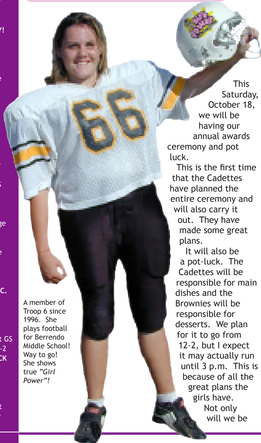
A member of Troop 6 since 1996. She plays football for Berrendo Middle School! Way to go! She shows true "Girl Power"!